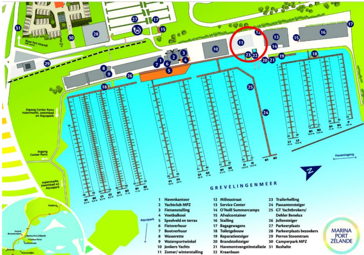
Fig. Map of the harbour, red circle shows the area for equipment inspection.